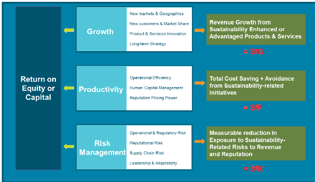
Figure 3: Operationalising the Value Driver Model

Figure 3 describes the model's three sustainability value drivers – growth, productivity and risk – and their subcomponents. The following sections look closer at each and how the concepts have been operationalised.