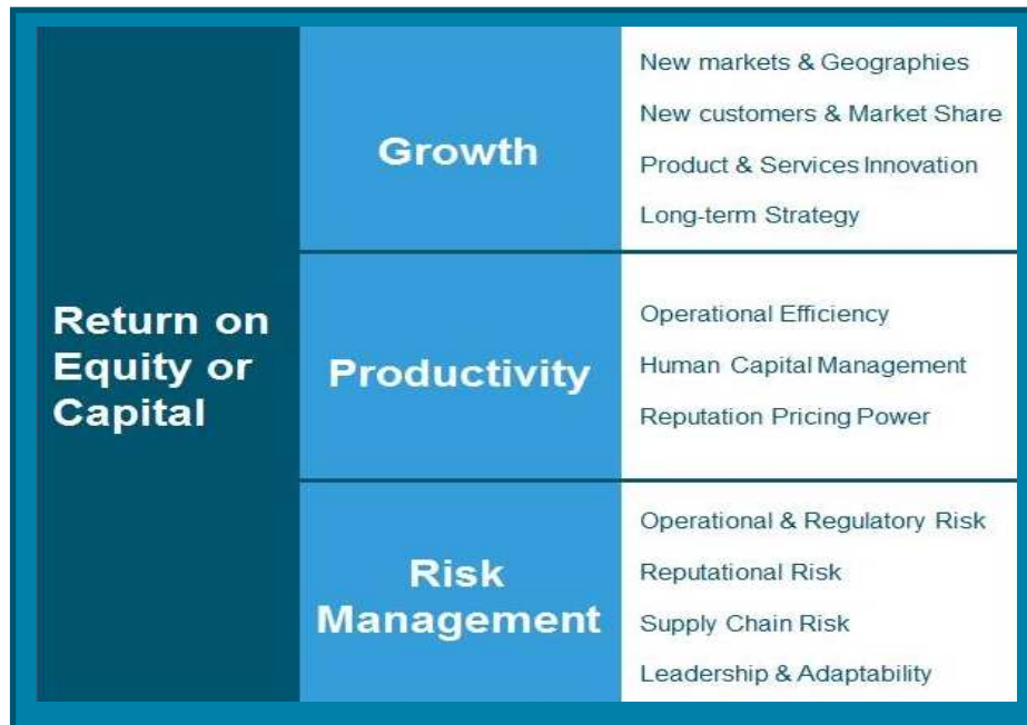
Figure 1: The Value Driver Model

The report focuses on these three value driver metrics (referred to as S/GPR) as a place to begin, though many other potential value drivers exist. It suggests that by first employing metrics to describe the direct impacts of sustainable business strategy on revenue, productivity (cost) and risk – before trying to measure more subtle, indirect effects – a company increases its chances of engaging a broader audience. Therefore, the model begins with an effort to measure these direct factors.